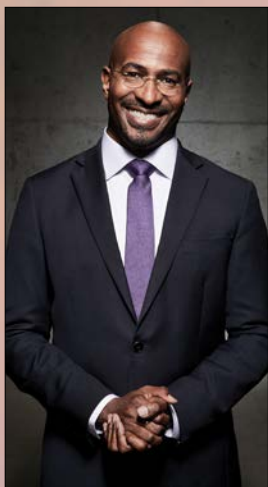
Keynote Speaker: VAN JONES CNN Host and Dream Corps Founder

12:00 noon – 2:00 pm Annual Seminar Luncheon Diamond 1-4 with Keynote Speaker